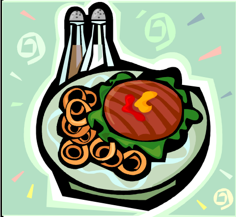
Food for the body!