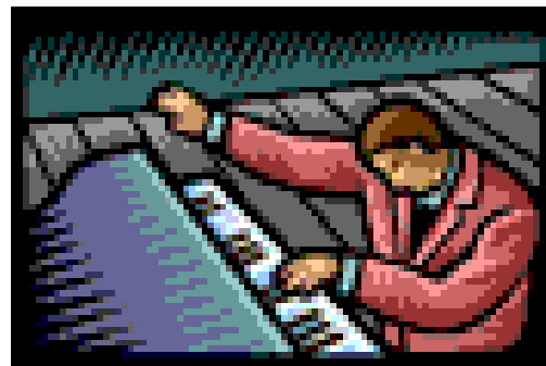
Food for the soul!